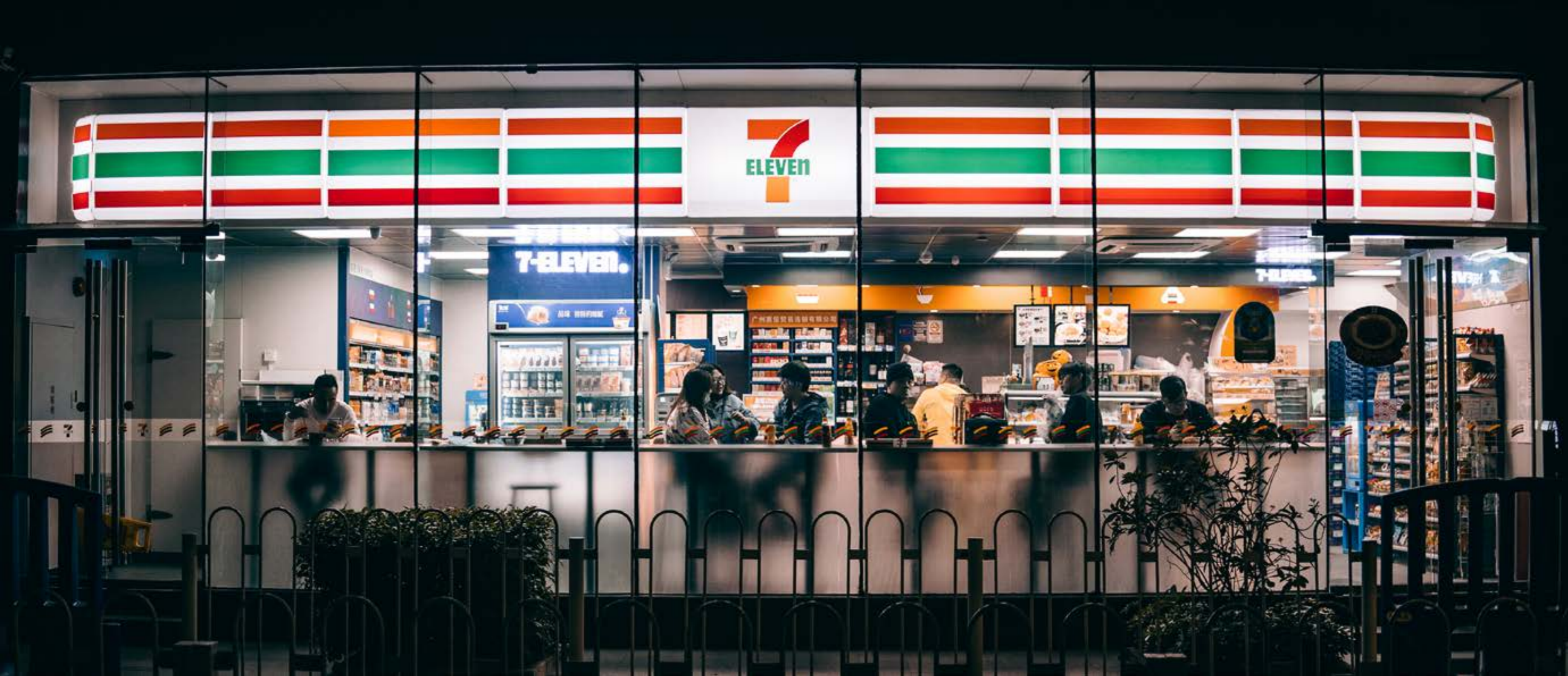
At midnight, people keep browsing in the new town.