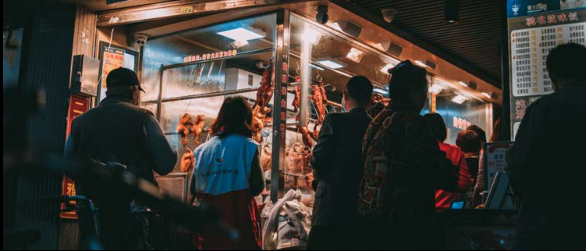
Roast goose restaurant. In fact, they sell not only roast goose but also chicken and pork with different cooking methods.