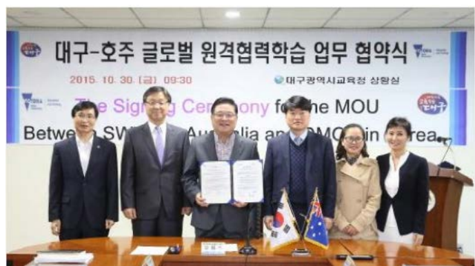
(Left) As featured on South Korean television. (Above) Celebrating the MOU signed with the SWVR DET Victoria.