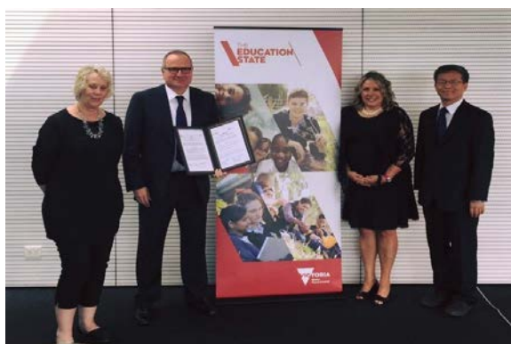
The MOU between the Daegu Metropolitan Office of Education and the South West Victoria Region of Victoria was signed in 2015.

'The Global LYNCs project provides authentic learning opportunities for schools while promoting global citizenship through engaging students in multicultural curriculum based activities. Students are provided with opportunities to gain a sense of Australia's and Korea's role in the global community.'