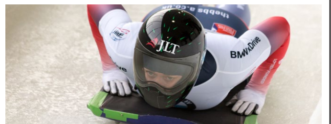
Winter Olympian, Lizzy Yarnold, competing in the skeleton event.