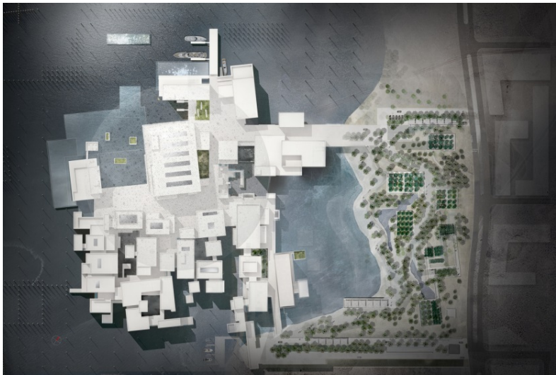
Louvre Abu Dhabi, © Ateliers Jean Nouvel, 2017 Ground Floor Plan